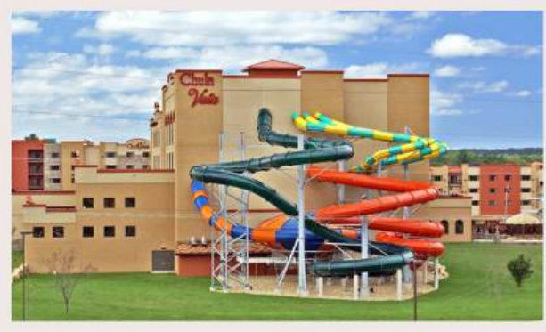
Chula Vista Resort

A big thank you to the Chula and all the hotel staff for continuing to be an amazing host for our con!